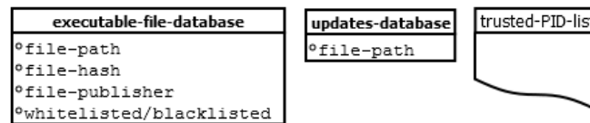
Figure 1. Data structures used in Automatic Updating

To allow of automatic software updating we identify updater files on per software basis and make them trusted updater. These trusted updater files can create further child processes (which in turn will be treated as trusted updaters) until updating finishes. At the time of process creation we extract process ID, parent process ID and if the process is trusted updater (either directly or by being child of trusted updater), add PID of the process to separate list called trusted PID (tPID) list. At the time of process termination we remove the PID from tPID list. The files downloaded by trusted updaters are logged to another database called updates database (updt-db). Apart from verifying the whitelisted files from executable file database we allow files to create process even if they are found in updates database (updt-db). We trust updates database because it contains files downloaded by trusted updater(s). To reflect the changes made to system files during automatic updating we move the files from updates database (updt-db) to system wide executable file database as whitelisted files. Figure 1, lists various data structures used during automatic updating.