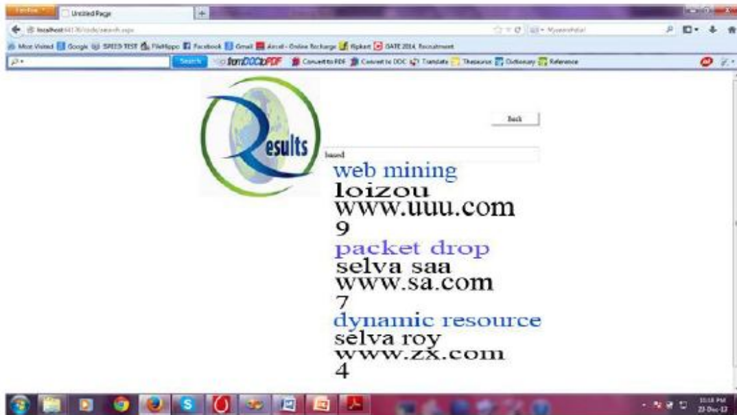
Table 1. Ranking Result