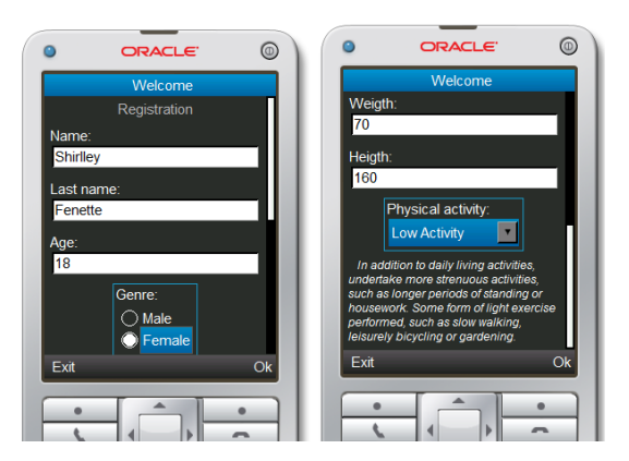
Figure 2 Representing personal data

Almost all countries are experiencing an obesity epidemic. In developed countries, obesity is not only common in the middle age, but is becoming ever more common among younger adults and children. The fact is that a poor diet may have an injurious impact on health. There is a need to provide a safe, evidence-based and easy-to-access dietary advice for everyone, especially children. Thus, we present a novel mobile application that allows us to obtain a custom and automatic plan to support people improve their general health.