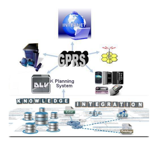
Figure 6 General architecture

The best known markup language is Hypertext Markup Language (HTML). Unlike HTML, WML is considered a Meta language. WAP also allows the use of standard Internet protocols such as UDP, IP and XML. Although WAP supports HTML and XML, the WML language (an XML application) is specifically devised for small screens and one-hand navigation without a keyboard. WAP also supports WML Script. It is similar to JavaScript, but makes minimal demands on memory and CPU power because it does not contain many of the unnecessary functions found in other scripting languages. The WAP programming model is similar to the Web programming model with matching extensions, but it accommodates the characteristics of the wireless environment. In figure 6, shows the proposed architecture for nourishing system. The module for obtain a custom and automatic plan to support people improve their general health was implemented as Web services using standard languages [15]. It takes data from a mobile device; these data are sent to the web service which returns a specific plan obtained from DLV<sup>K</sup> system, similar to [10].