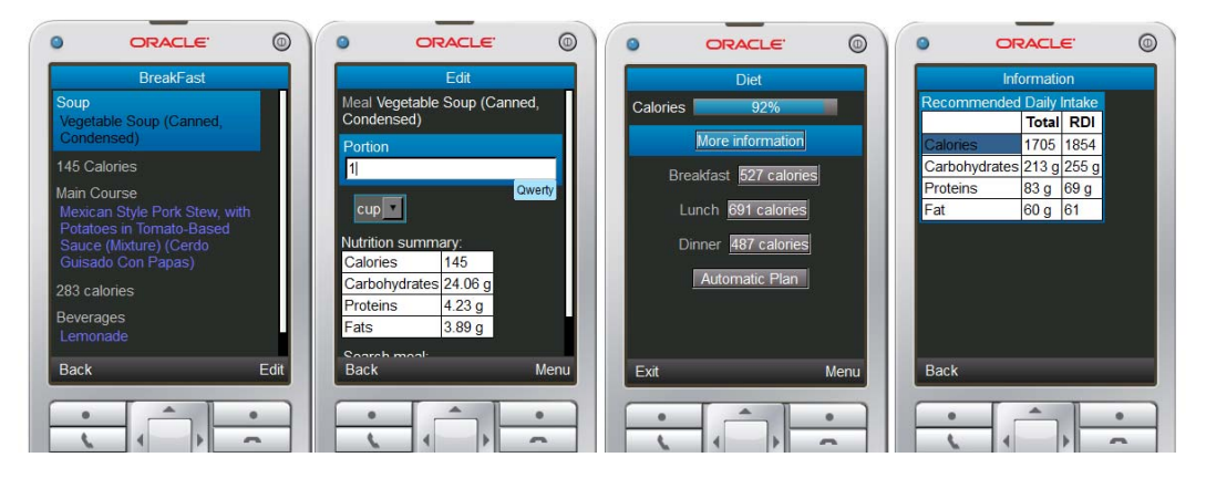
Figure 4a) Interface to modify diet

This plan is most adequate to ideal values proposed (as you can see in Figure 4b). The commandline option -N=1000 tell dlv to compute operations until number 1000 as maximum value. Option -FP is used to invoke the planning front-end in dlv. Alternatively, one can use the options -FP opt and FPsec, which explicitly enforce optimistic and secure planning, respectively. For planning problems with a unique initial state a deterministic domain, these two options do not make a difference, as optimistic and secure plans coincide in this case. This solution is clear, simple and all rules in IR and CR have to satisfy the safety requirement for default negated type literals, i.e., each variable occurring in a default negated type literal has to occur in at least one non negated type literal or dynamic literal.