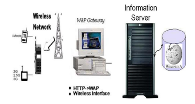
Figure 5 Architecture for our application

standard for application layer network communications in a wireless communication environment. Its main use is to enable access to the Mobile Web from a mobile phone or PDA.